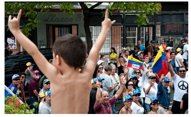
A child shows his support to the Venezuelan Political Opposition.

Shortly after these develoments Agora, a group affiliated to S-CAR, held an open discussion on freedom of speech, and immediately after the discussion I felt compelled to write about my perspective on the Venezuelan crisis, not only as someone who has been constantly interacted with the crisis through Twitter, but as someone who has been fasci-