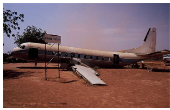
Welcome to Rumbek.

he Southern Sudanese Women's Initiative for Peace Education (SSWIPE) is a project that seeks to facilitate peacebuilding in South Sudanese communities by engaging women as community members, utilizing dialogue to find common ground, and teaching peace education while meeting students' practical needs. Through a part-